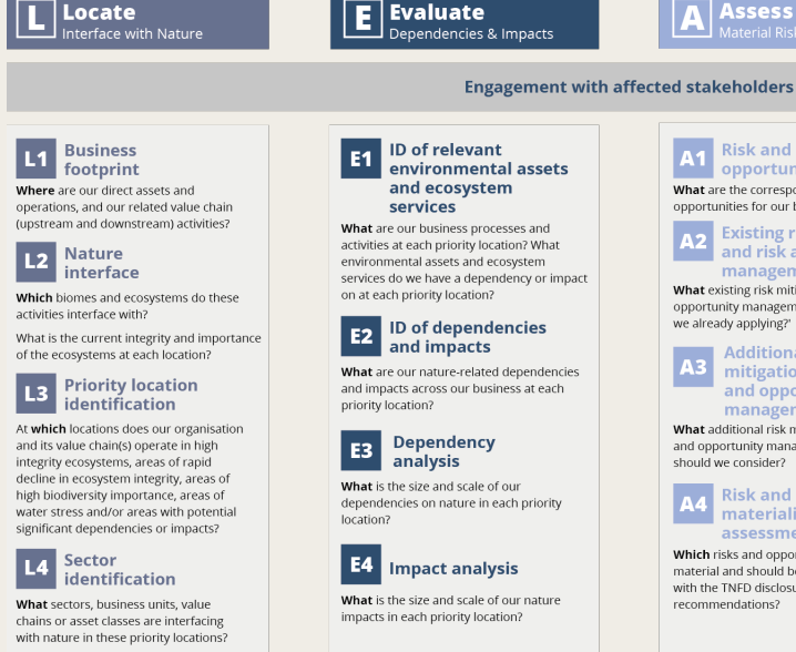
Figure 2: Overview of LEAP

As such, not everything that is identified, assessed and evaluated using the LEAP approach needs to be disclosed.