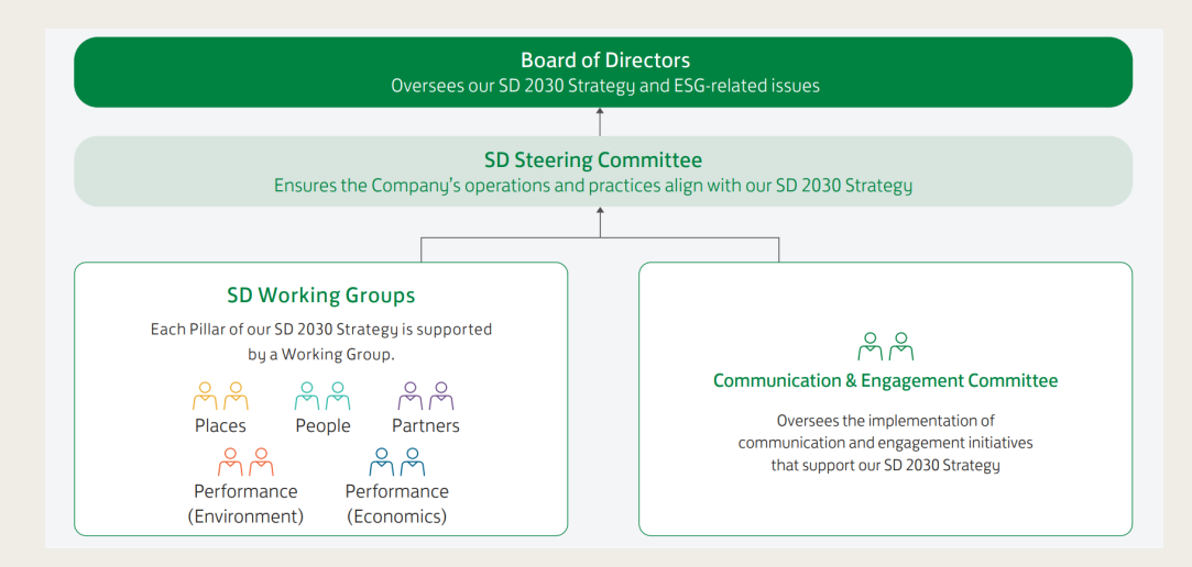
Figure 1: Governance Structure.